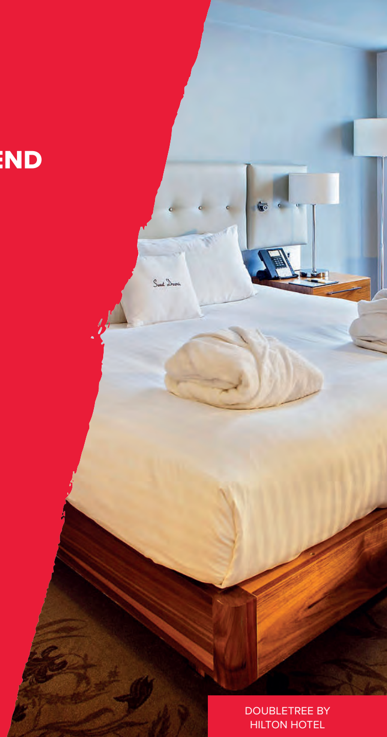
DOUBLETREE BY HILTON HOTEL

Search for places to stay and plan your break at visitlincoln.com/stay .