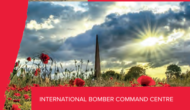
INTERNATIONAL BOMBER COMMAND CENTRE