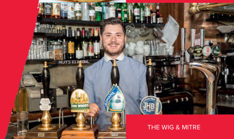
THE WIG & MITRE